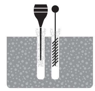
Blow and brush the hole clean of dust and other material.