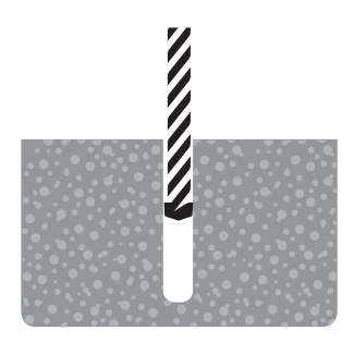
Drill a 20mm hole (Y-Cutter drill bit recommended) to the correct embedment, this should be no more than 80% of the base material thickness.